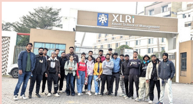
Students participated in Ensemble Valhalla- XLRI Fest 2024