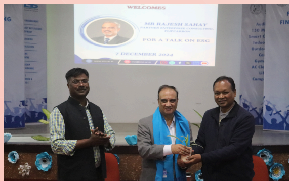
Speaker felicitated during the Leadership Talk

'How is one is able to envision the future and prepare themselves' and the second 'How does one create a USP'. He emphasised on the business opportunities in today's time like mental wellbeing being a rising business. He talked about the climate change concern across the globe, the movement of demographics in present context, and how a growing economy means a growing population.