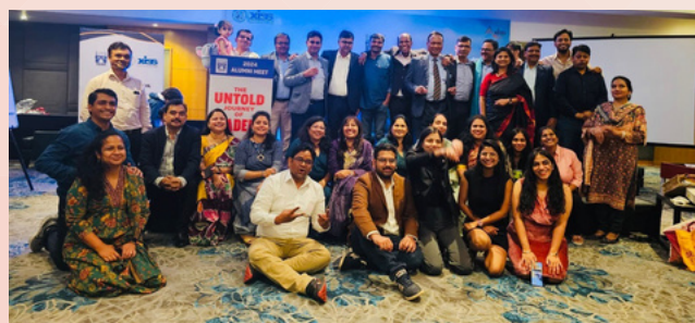
XISS Alumni Association Hyderabad Chapter (XAAH) organised an Alumni Meet

To watch the proceedings of the event, click on the link: