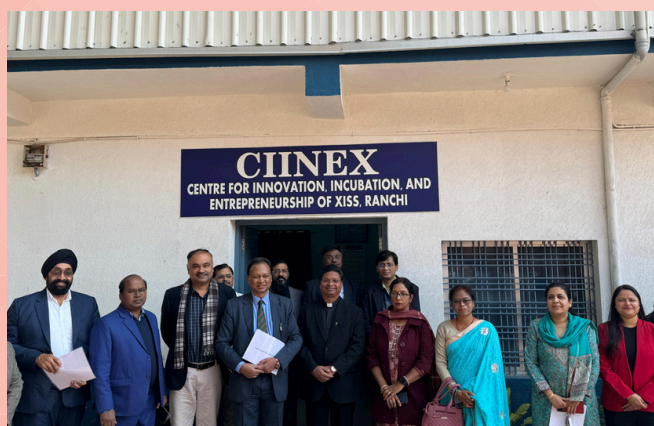
Innovation and Entrepreneurial dreams find a platform with CIINEX

XISS, Ranchi, inaugurated the Centre for Innovation, Incubation, and Entrepreneurship of XISS (CIINEX) on its campus on 6 December 2024. This initiative marks a significant step in fostering a culture of innovation and entrepreneurship, focusing on providing support to students, tribal communities, and aspiring entrepreneurs to create sustainable solutions.