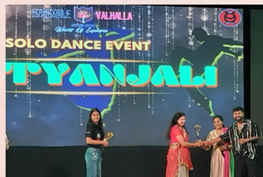
Student won an award during the Ensemble Valhalla- XLRI Fest 2024

Team XISS participated in sports events namely Basketball, Badminton, and Table Tennis. In cultural events, XISS students displayed their talent in Nukkad Natak, Solo Singing, and Solo Dancing. Other participants were from IIM Bodh Gaya, IIM Sambalpur, IIM Ranchi, XIMB Bhubaneswar, and XLRI Jamshedpur.