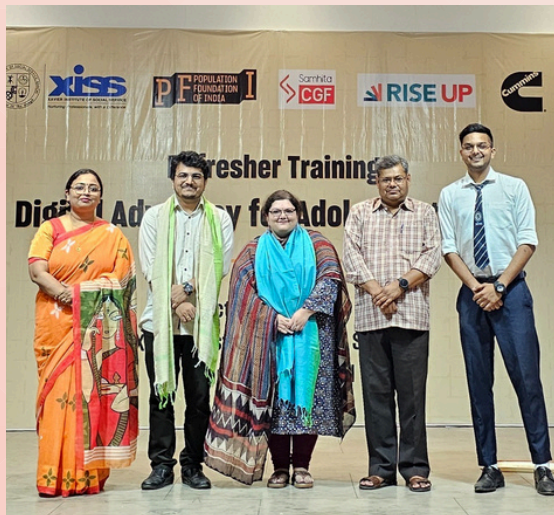
Training of Digital Advocates for Adolescent Health Fellows organised