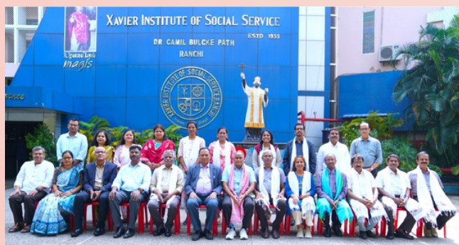
FDP on Business Education and Industry 5.0 organised for JIM Trichy Faculty