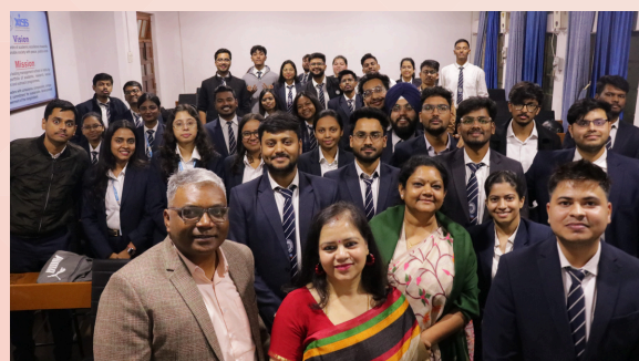
Silver Jubilee Alumni Meet of XISS Batch 1997-1999 (PGDM PM) celebrated