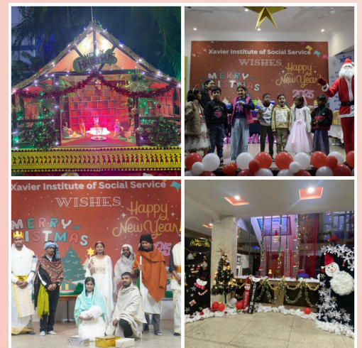
XISS decked up with decorations during the Christmas celebrations

https://xiss.ac.in/readmore/xiss-celebrates-the-christmas-spirit-with-carol-skit-and-festive-cheer