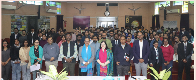
Leadership Talk on Environmental, Social, and Governance (ESG) organised