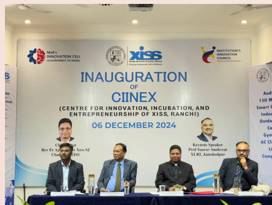
Dignitaries during the inauguration of CIINEX

Later, guests visited the stalls put up by the entrepreneurs. The inauguration of CIINEX marks a pivotal moment in XISS's journey toward empowering communities and fostering impactful entrepreneurship.