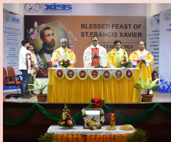
Feast of St Francis Xavier celebrated

https://xiss.ac.in/readmore/feast-of-st-francis-xavier-celebrated