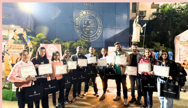
Students from several B-Schools compete at "MAXFEST- 3.0"

XISS, Ranchi, hosted an Inter B-School Competition "MAXFEST 3.0," organized by the Marketing Management Programme and Markbuzz, the Marketing Club of XISS, Ranchi, on the campus. Students from TISS Mumbai, St. Xavier's College, Amity University, and XISS, Ranchi participated in eight competitive events throughout the day.