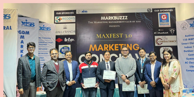
Students during a Panel Discussion organised at "MAXFEST- 3.0"