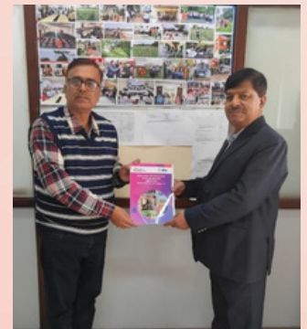
ESG Report Submission: Social Audit of Usha Martin Foundation's CSR Initiatives (2023-24)