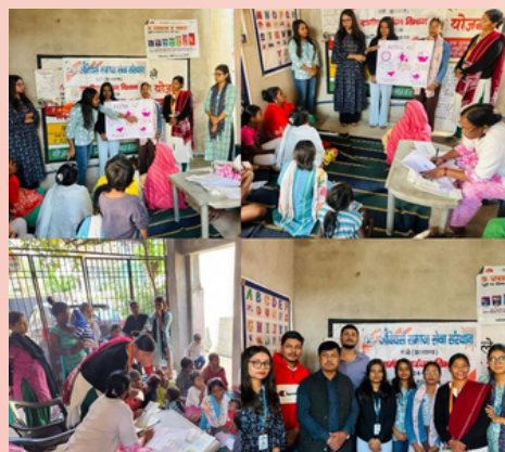
ASHA Group – Lowadih Hosts Awareness Event on Personal Hygiene

Haemoglobin testing to detect anaemia; and blood pressure checks for early detection of hypertension. A total of sixty-eight patients were screened during the camp. Among them, 9 patients were diagnosed with anaemia, including one severe case of acute anaemia that required immediate attention. The response from the community was overwhelmingly positive. Residents expressed their gratitude for the accessible health services and timely medical support. The camp not only provided immediate healthcare but also fostered trust and encouraged the community to seek regular medical care. This initiative highlights the importance of collaborative efforts in promoting health and well-being in underserved urban areas.