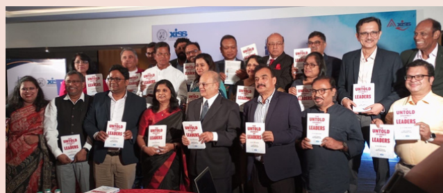
Dignitaries release the book 'The Untold Journey of Leaders'

https://xiss.ac.in/readmore/xiss-xaah-organise-alumni-meet-in-hyderabad