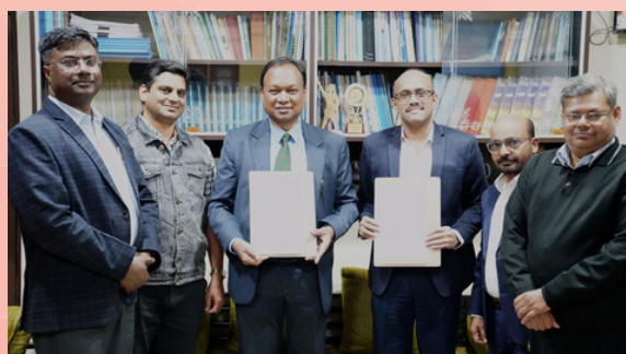
Dignitaries with the signed MoU between XISS and BAIF

On 6 December 2024, a significant milestone was achieved with the signing of a Memorandum of Understanding (MoU) between XISS, Ranchi, and BAIF Development Research Foundation marking the beginning of a strategic collaboration aimed at fostering growth and development in various sectors. The partnership will focus on critical areas such as knowledge exchange, research, joint projects, incubation, internships, and placement opportunities, providing a platform for mutual growth and advancing social impact initiatives.