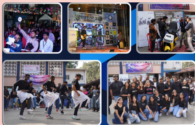
FINFEST 2.0 - an Inter College Competition

The event marked the presence of several students across events from St. Xavier's College, Birla Institute of Technology, Lalpur, Kejriwal Institute of Management and Development Studies, Amity University, Institute of Hotel Management Catering Technology & Applied Nutrition, Institute of Management Studies, Sarala Birla University, Marwari College, and XISS.