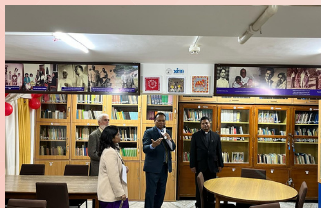
Dr K S Singh Tribal Resource Centre at XISS