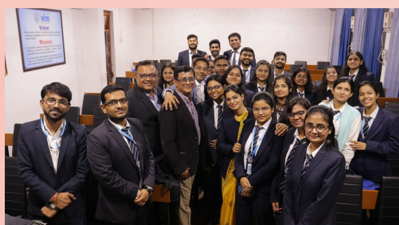
Students interact during the Silver Jubilee Alumni Meet of XISS Batch 1997-1999 (PGDM PM)

The alumni reiterated their commitment to supporting XISS in its endeavours, underscoring the unbreakable bond between the institute and its alumni. The event featured engaging panel & classroom discussions on emerging trends in HR, which saw enthusiastic participation from alumni, faculty and the students.