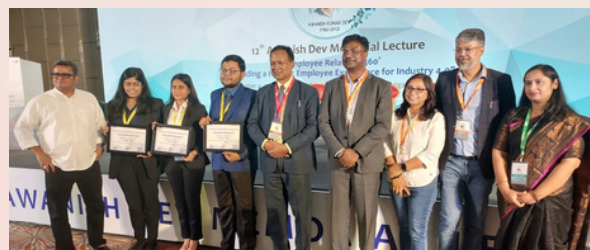
Recipients of the Maruti Suzuki XISS Awanish Kumar Dev Memorial Scholarship

https://xiss.ac.in/readmore/12th-awanish-dev-memorial-lecture-organised-by-xiss-msil