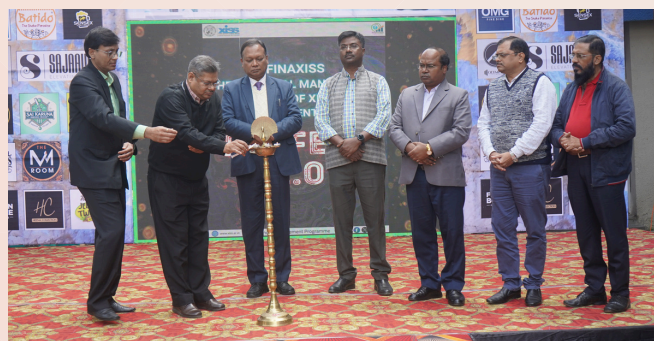
Dignitaries light the lamp during FINFEST 2.0 - an Inter College Competition