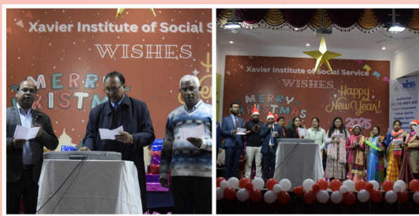
XISS celebrated the Christmas Spirit

XISS, Ranchi, celebrated Christmas Gathering for its faculty, staff, and students spreading festive cheer across the campus. The gathering began with an inspiring speech by Director, XISS, who emphasized saying that Christmas is a celebration of everyone and a time for fostering peace, justice, and reconciliation. He also shared insights into the Greek concepts of Kyrios (Lord), Koinonia (fellowship), and Kerygma (proclamation), encouraging everyone to embody these values.